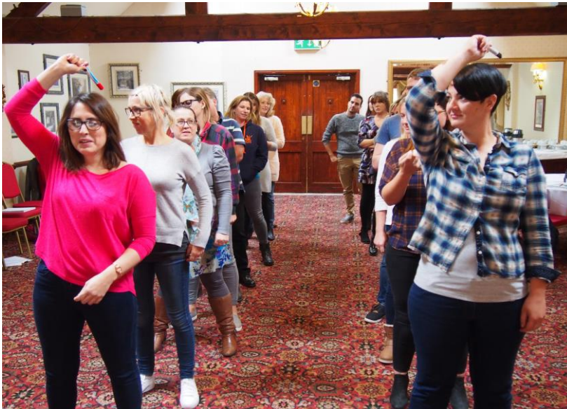
Photo: Participants in a social pedagogy course.

We are about to launch SPPA Founding membership in early 2017. Membership benefits will include continuous professional development opportunities such as a conference, focused learning days and webinars, networking, access to online resources and an online forum. Further details will be available soon! Find out more about membership and join our mailing list to get regular updates from us.